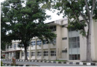
RUANG KULIAH Gedung Utama Lt.II