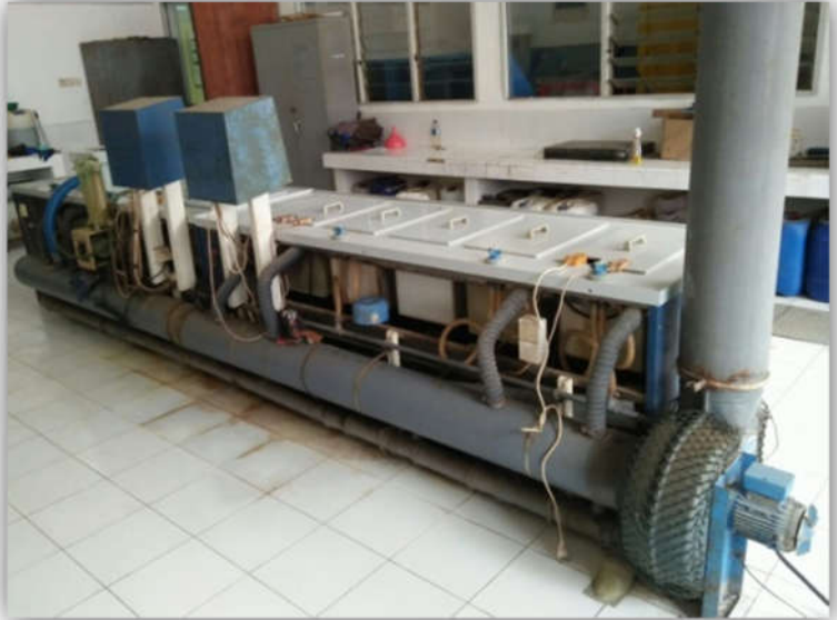
Anodizing Heater SIEMEN 1200 °C