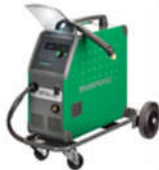
PI 500 Plasma