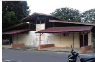
LAB.OTOMOTIF (Unit Roda Dua)