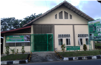
LAB.PENGELASAN & FABRIKASI LOGAM