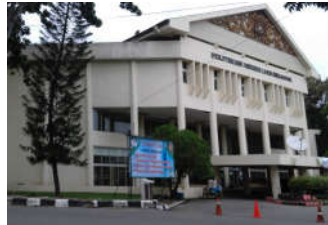
JURUSAN TEKNIK MESIN Gedung Utama Lt.II